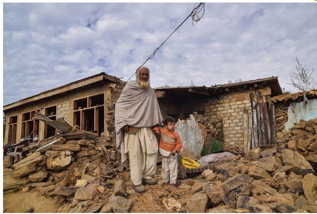
Community World Service Asia

played a leading role in training Dalit and tribal women to participate in local government. His dedication to those he worked with will be missed.