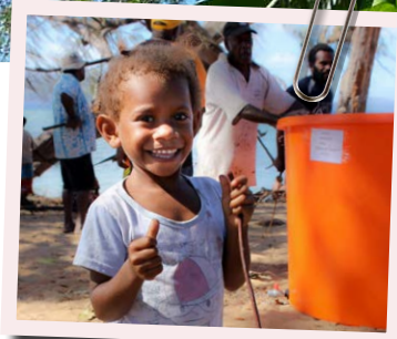
Fresh water for Vanuatu.