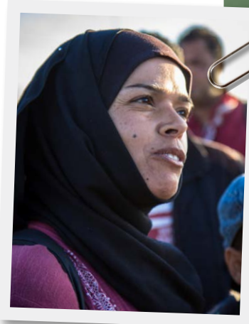
Their mother is grateful for the help she has found on the way.

The one way to stop the surge of refugees is to tackle the causes of the conflicts, but for now action is needed to give the refugees what they lack: safety, food, water, medical care, shelter and support. It is work that our partners do well.