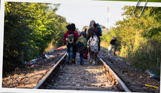
After a brief stop, their journey continues along the Hungarian border.

There is a lot more to learn as we work with our partners to make sure the poorest people have a decent livelihood and are treated fairly in our increasingly complex world.