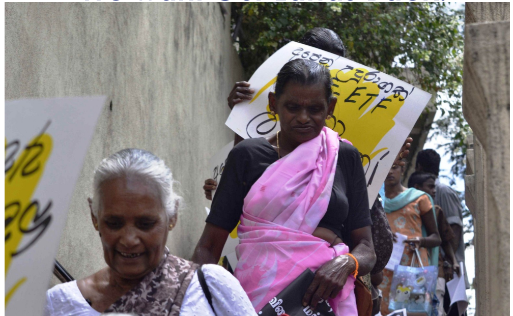
Plantation workers march for their land and dignity.

The Movement for Land and Agricultural Reform (Monlar) has made food sovereignty a priority. They work with poor peasant farmers to grow more and better food using improved agro-ecological methods. Land is critical to their future development. Tamil workers brought from India to work in the rubber, coffee and tea plantations are extremely poor, living in small one room dwellings. With their own land, they would have food and opportunity.