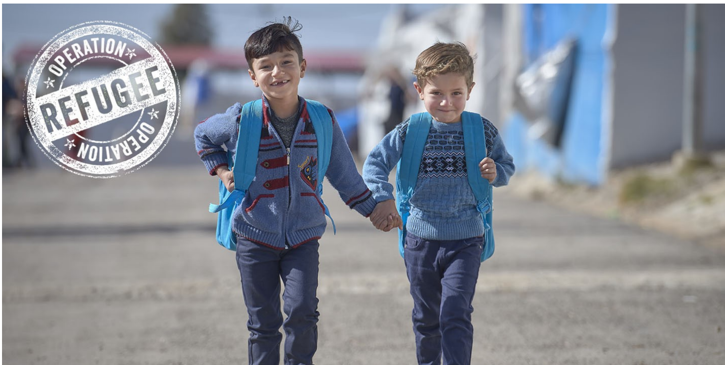
Photo: Yazidi boys returning from school in northern Iraq. ACT Alliance members have supported Yazidi and other displaced people for many years.