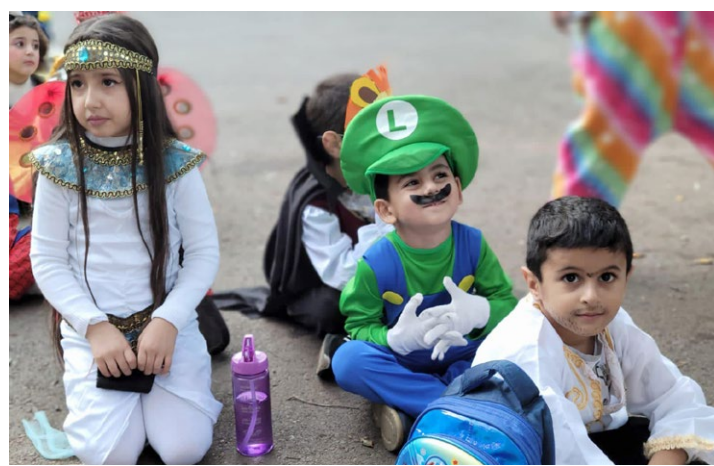
By participating in DSPR's programmes, the children can forget about their worries for a few hours.

Ensure inclusive and equitable quality education and promote lifelong learning opportunities for all. See: https://sdgs.un.org/goals/goal4