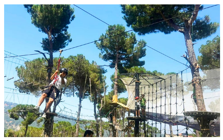
Older children enjoy visits to the forest, zoo, or swimming pool as part of the Summer Camp programme. It is a welcome break from the cramped refugee camps or crowded places where they live.