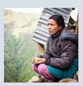
Gave $102,822.40 to the ACT Appeal for Nepal.