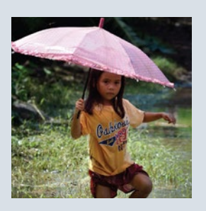
Youth Topics: "More Climate Change Means Less Food".