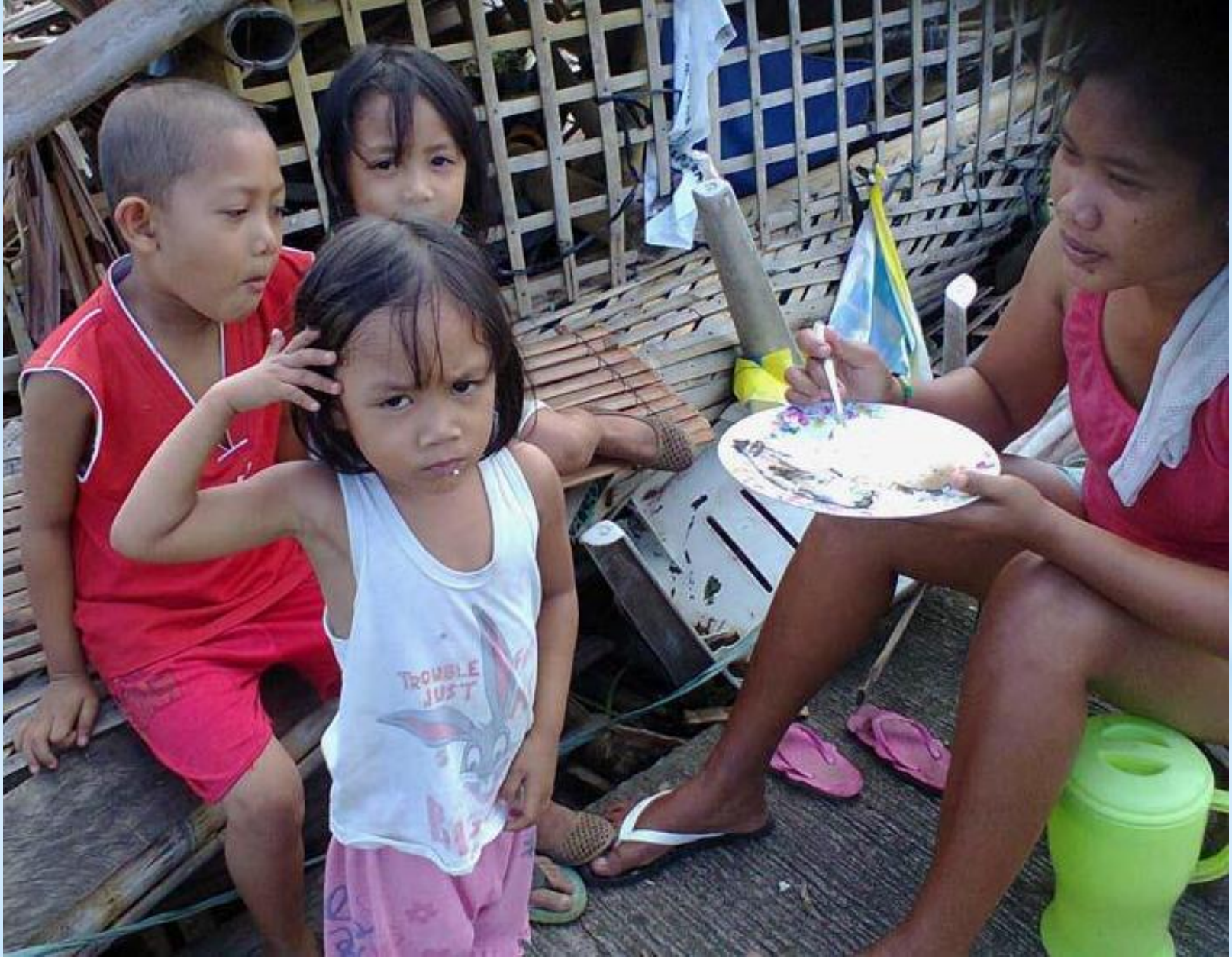
A mother feeds her children outside their fallen house.