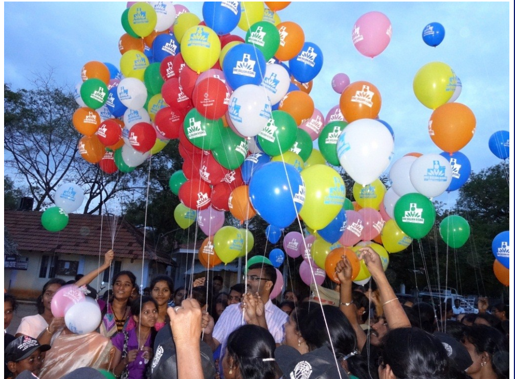
Madurai rises up against violence against women.

EKTA is one of many local groups active in the new global campaign to end violence against women and girls, One Billion Rising . EKTA has been at the forefront of activity in Madurai, Tamil Nadu. The local committee prepared for the global day of action with banners, handbills, public meetings and a mobile van for outreach.