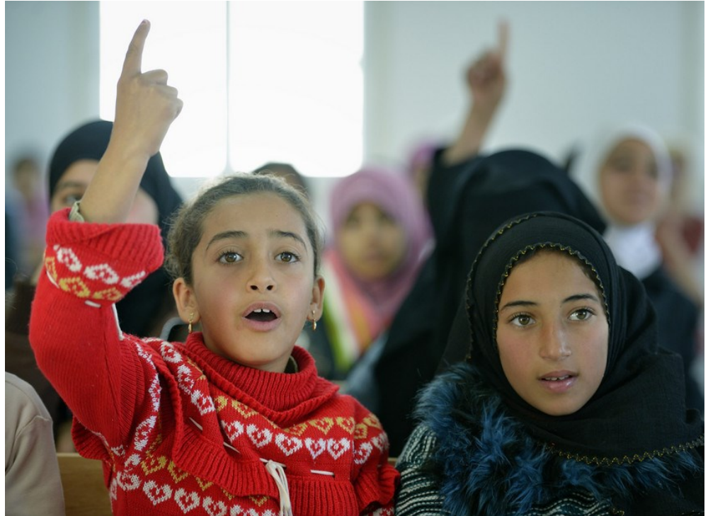
A new fund to provide education for 35 million children missing out on education because of humanitarian crises was launched at last month's World Humanitarian Summit. Syrian refugee children in Jordan's Za'atari Camp say yes to school.

UNHCR, the United Nations Refugee Agency reported there were 65.3 million displaced people in 2015, up from 59.5 million. Syria, Afghanistan and Somalia produced more than half of the world's refugees. Colombia, Syria and Iraq were home to the majority of the world's displaced people. High levels of conflict and persecution pushed an average of 24 people every minute to leave their homes. "More people are being displaced by war and persecution and that's worrying in itself, but the factors that endanger refugees are multiplying too," said UN High Commissioner for Refugees Filippo Grandi. The journey to safety is becoming increasingly perilous and funds for relief fail to meet the escalating needs.