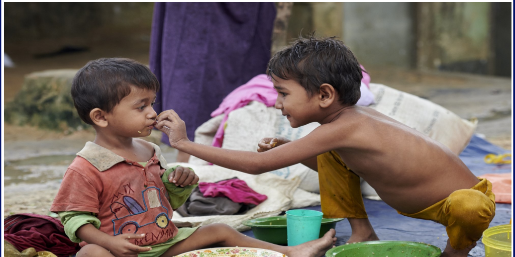
These Rohingya children are two of the world's 68.5 million displaced people.

The number of displaced people in the world continues to grow according to the United Nations Refugee Agency, UNHCR. Up 2.9 million from 2016, the 2017 figures point to a global failure to contain the conflicts driving people from their homes. This represents an average of one person displaced every two seconds.