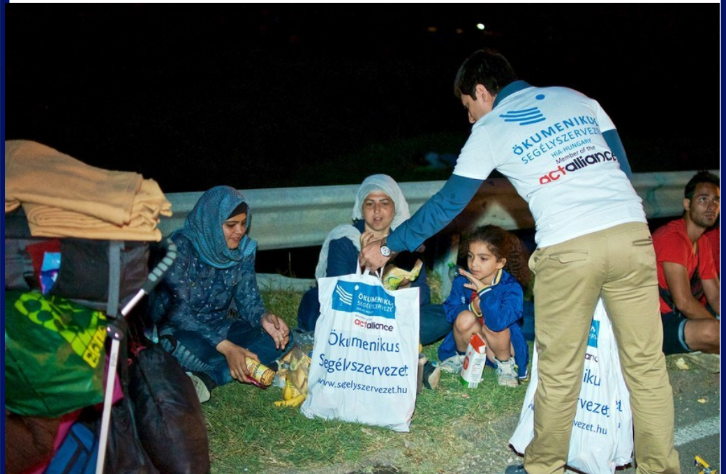
ACT Alliance members in Hungary distributed food and water to exhausted refugees along Hungary's M1 highway.

In Europe ACT Alliance members are providing food, water, blankets, shelter, psycho social care and support to many refugees arriving by land or sea. They are assisting some of the people who have fled conflict in Syria, Afghanistan, Eritrea, Libya and more. CWS partner the Department of Service to Palestinian Refugees is providing relief assistance to Syrian refugees in Jordan and Lebanon, made more urgent because of cuts in UN food parcels for refugee families. Falling UN funding is making it tougher for families pushing many more to risk the journey to Europe.