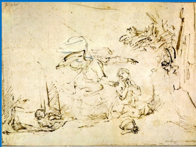
Rembrandt: "The Angel Appears to Hagar"