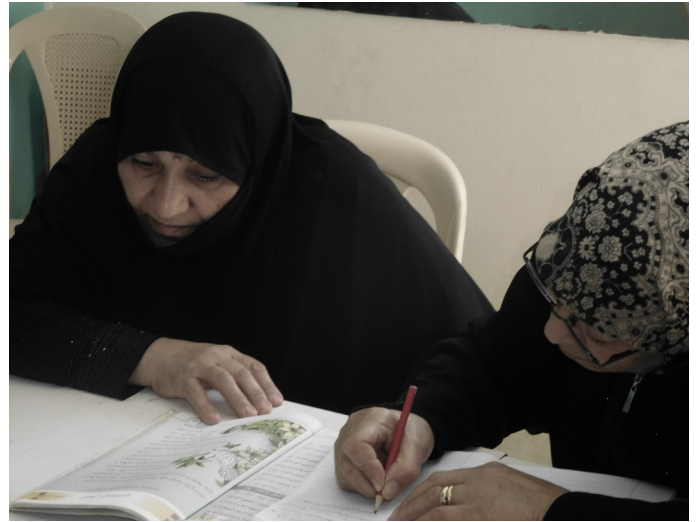
Syrian women improve literacy skills with DSPR.

According to Matthew following Jesus is not easy. He was writing for people whose world was defined by their family. The family provided the only security and support. To leave this protection, could put a person in great danger. Jesus turns this support structure on its head, challenging the social and economic order. In a turbulent time a new Christian could not rely on family or their old community for food and protection. Instead they become part of the 'Jesus-community' operating by different rules, for example hospitality (v.40). In choosing to follow Christ, we are challenged to live out God's radical hospitality in Aotearoa New Zealand and in the wider world.