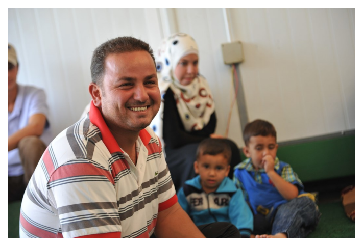
Resources Invite local

Write to the Prime Minister and the Minister of Immigration Michael Woodhouse asking them to increase New Zealand's refugee quota, currently 750 people. Now a member of the Security Council, New Zealand has greater responsibility to minimise the human suffering from conflict situations. You might also consider asking New Zealand to give more aid for Syrian and Iraqi refugees by writing to the Minister of Foreign Affairs Murray McCully. You can write: Freepost Parliament, Parliament Buildings, Private Bag 18888, Wellington 6160.